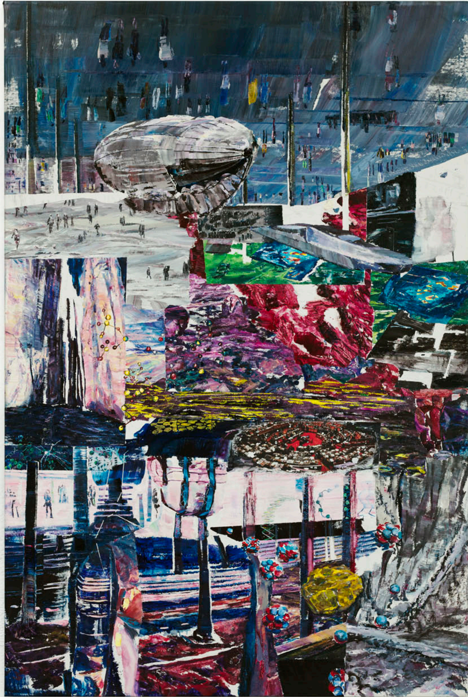
One man, no man, 2022, oil and emulsion on canvas, 171 x 114 cm | 67 1/3 x 45 in. Private collection, Germany