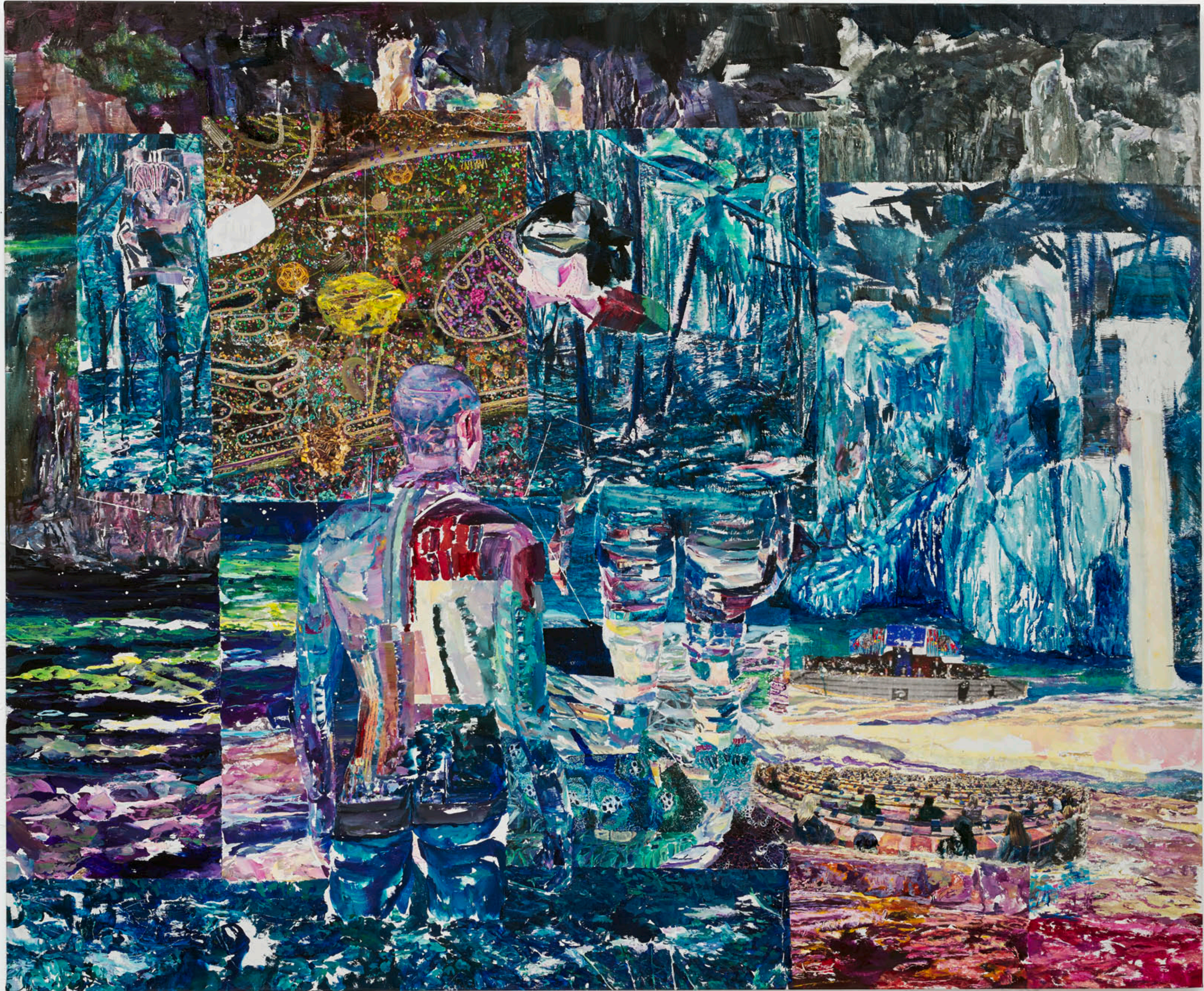
Zehn Tage die Woche \ Ten days the week, 2021 Oil and emulsion on canvas 165 x 200 cm 65 x 78 3/4 in. Private collection, Germany