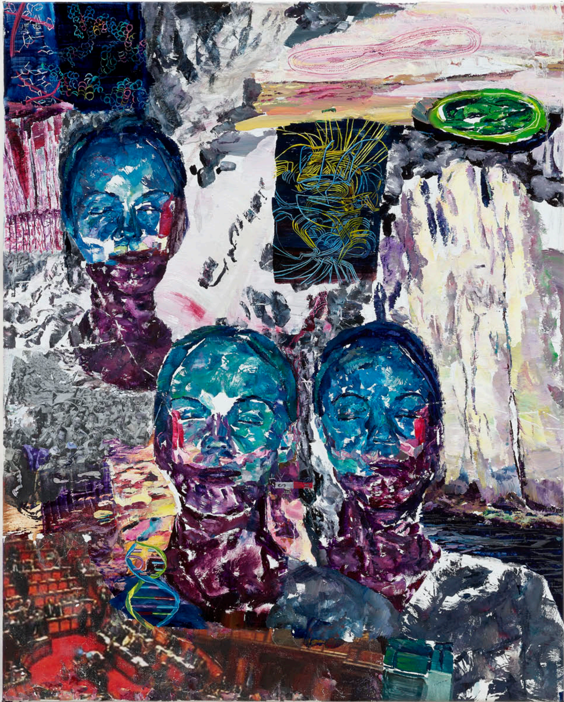
- 2022, Oil and emulsion on canvas, 96 x 76 cm | 37 1/2 x 30 in.